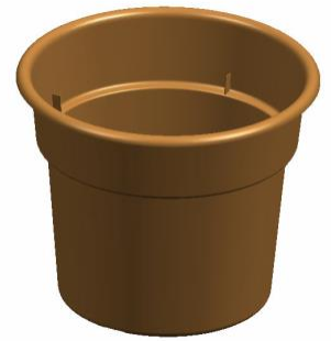
8" - 10" - 12" - 14" sizes

The 10" patio pot has a slightly larger volume than the 9.5" planter pot and is impressive anywhere plant color and beauty is required.